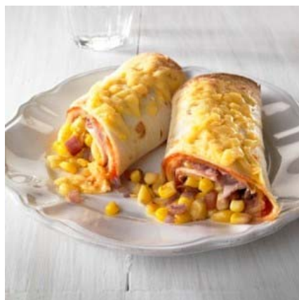
Grilled cheese wrap with corn and ham Beemster Gourmet Dutch Cheese